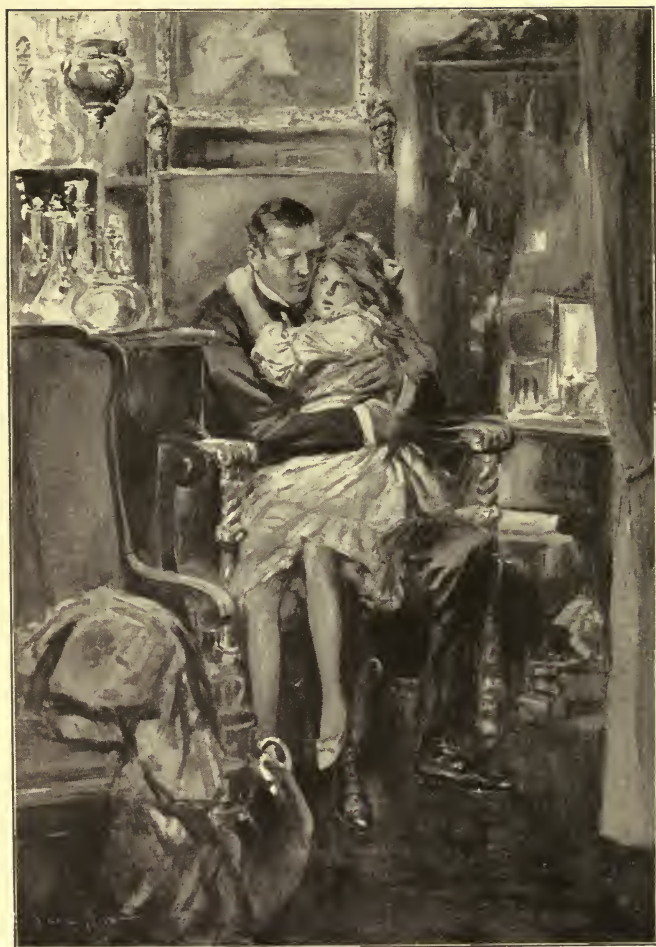
The little lady had to be coaxed into one of the easy chairs in the improvised office and comforted